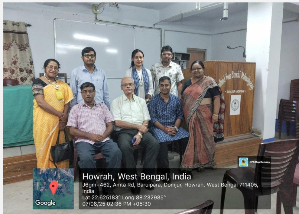
Teachers of different Academic Departments