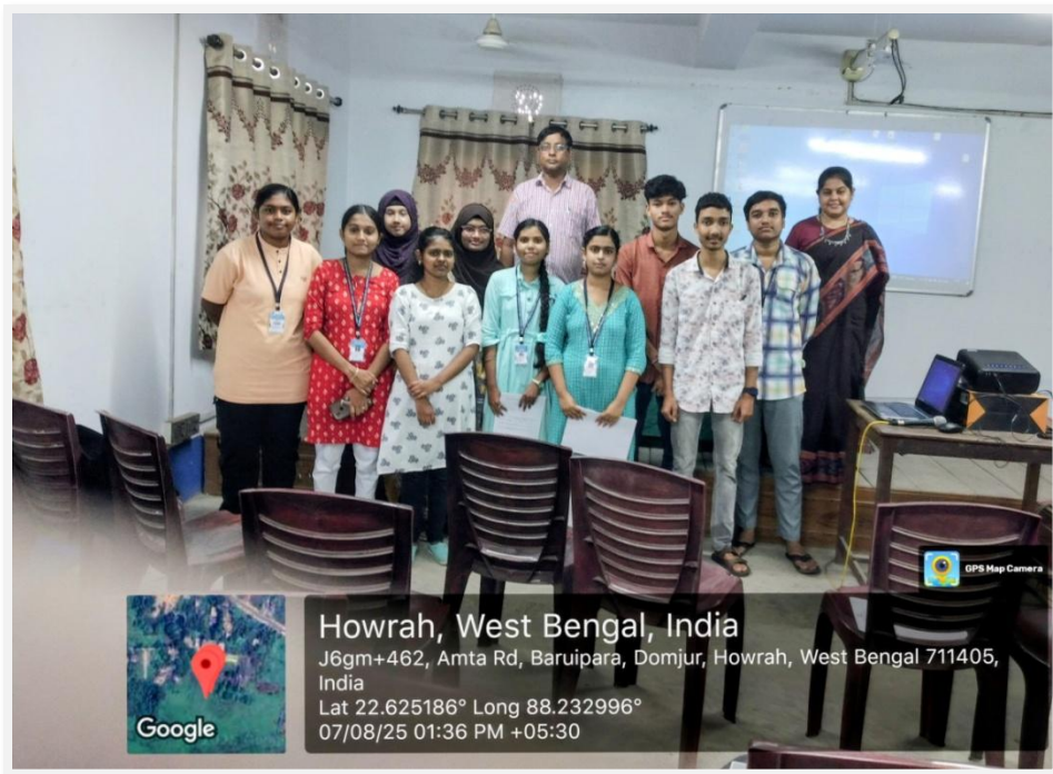
The Department of English, Semester II (CCF)