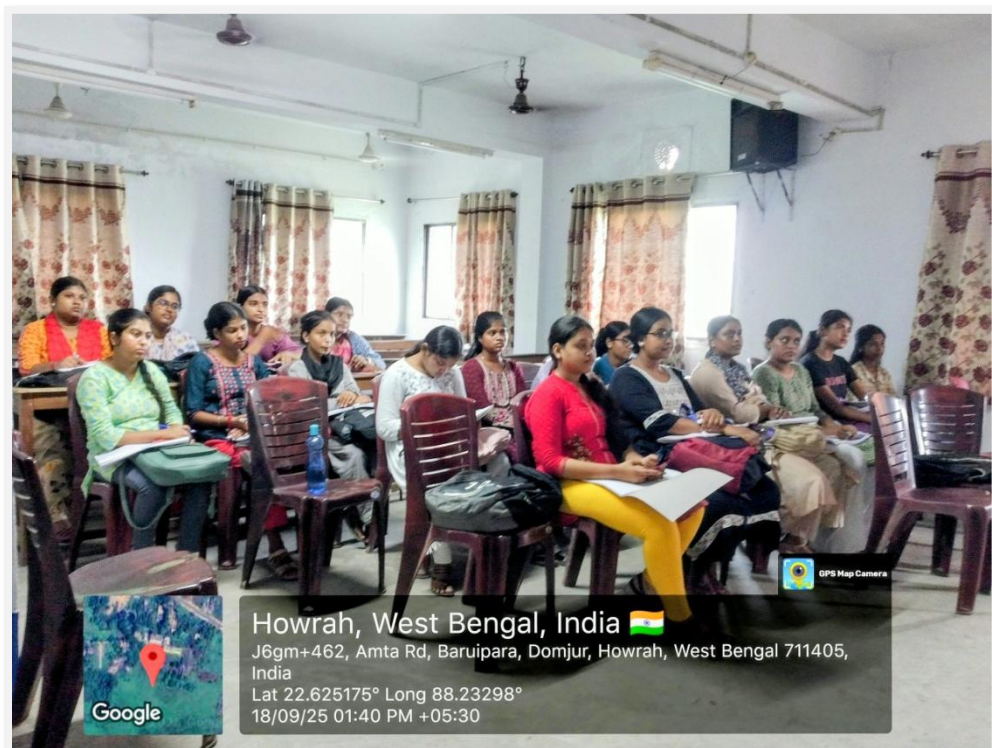
The students of Semester I (CCF) 2025-26