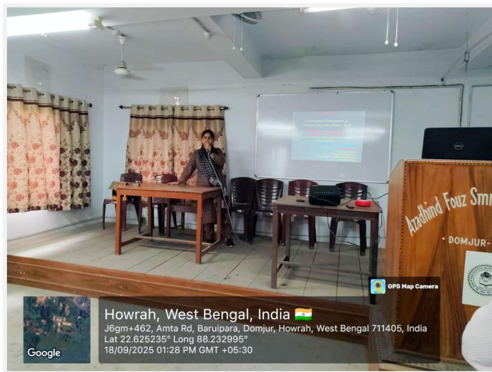
IQAC Coordinator inaugurates the Workshop