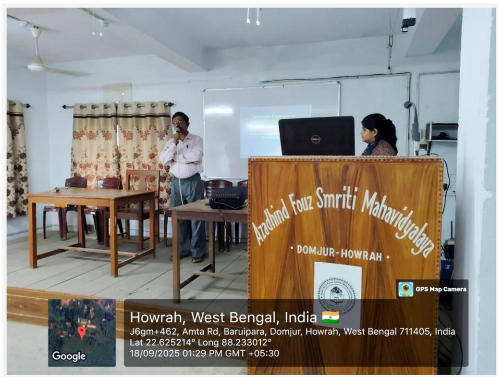
The Principal speaks on NEP 2020